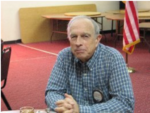
ALWAYS great to see Barry Fitzgerald!