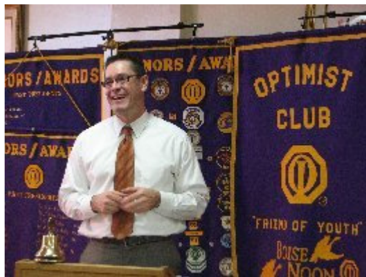
"All indications are that 12 months out, the Dow will be at $1,450."