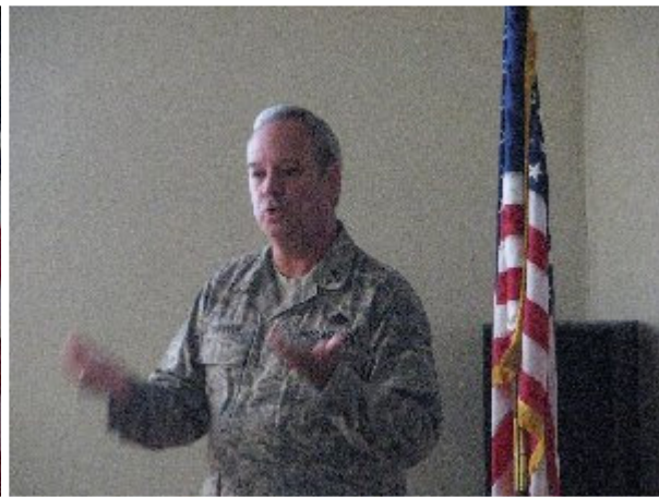
The General gave us a clear concise presentation.