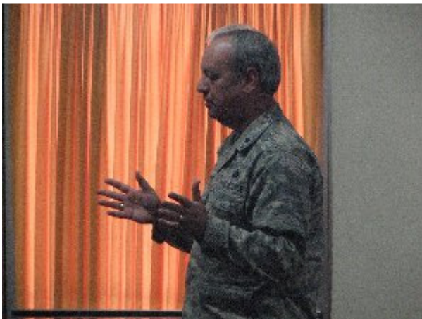
Boise has excellent infrastructure for the F-35