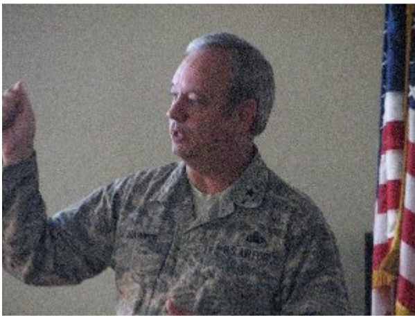
The General talk about the new F-35 coming to Boise. Yes, he talked of the noise situation.