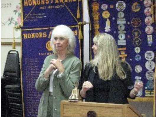
Thank you ladies for stepping up to take the President job.